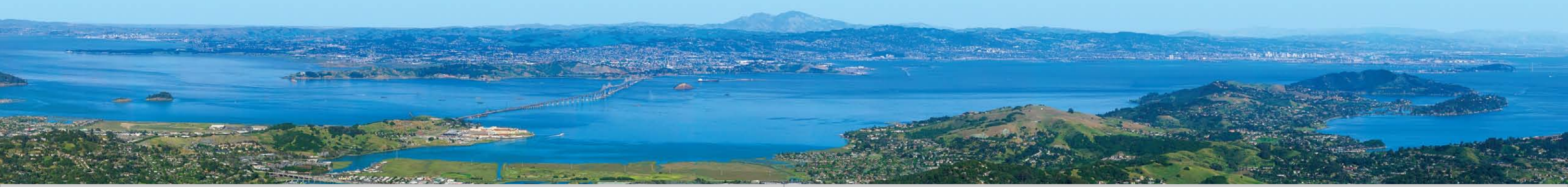
JEFF CHEN KUO CHIH, WWW.VISTAPOINTSTUDIO.COM