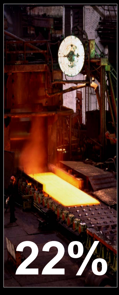
Built Environment Transport