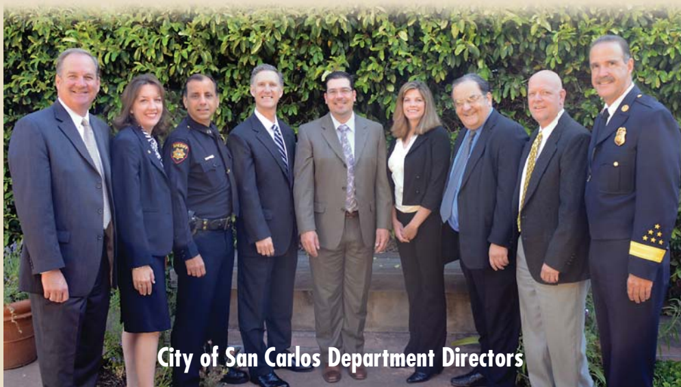
City of San Carlos Department Directors