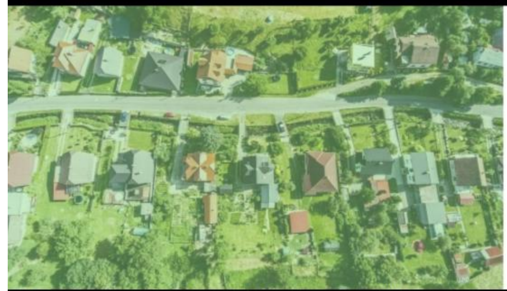
This series is hosted by the Institute for Local Government with funding from the California Department of Housing and Community Development